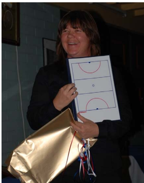
The 2008 Committee